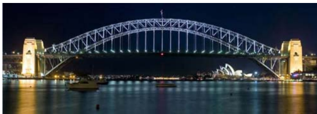
Sydney Harbour Bridge and Opera House