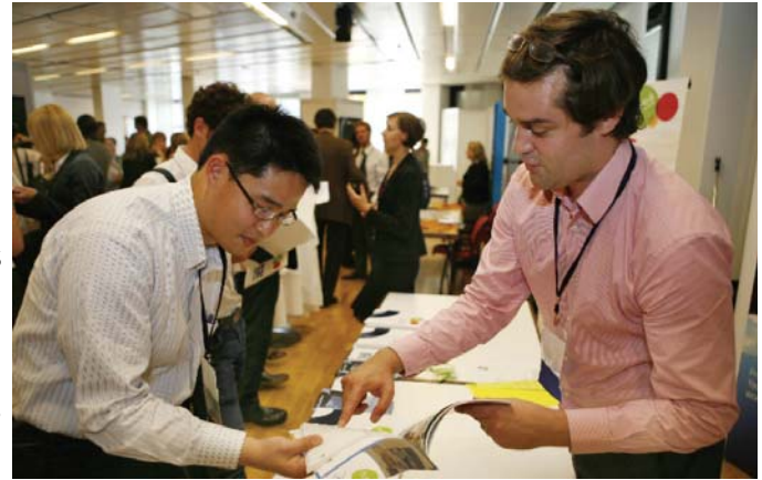
Exhibitor Stand, IWA Conference, Vienna

Conference topics are broad and include the water cycle, water and wastewater technology, engineering, science and management with a water focus. The inclusion of an interactive Professional Development Day , and in particular the Careers Exposition , will provide a unique opportunity for interaction between leading YWPs from all corners of the globe and Australian water sector personnel. The delegates will have the opportunity to discover Sydney and enjoy the unique aspects of the Australian way of life.