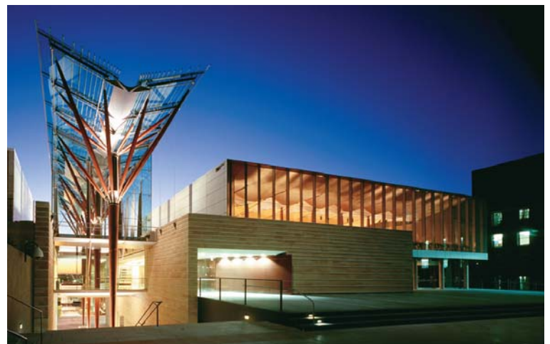
The John Niland Scientia Building, UNSW